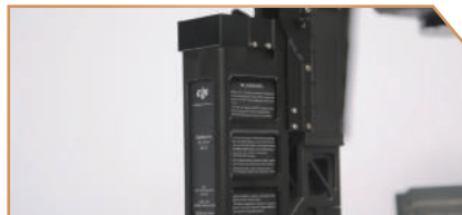
Quick Release Smart Battery System with 4-Hour+ Run Time