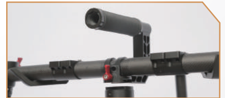
Quick Release Top Handle Bar for Easy Break-Down & Mounting to Various Platforms