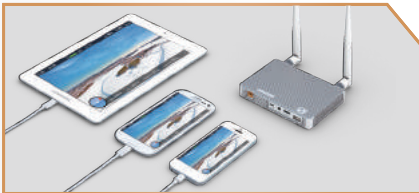
Support for DJI Lightbridge Full HD Video Downlink