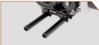
Dual 15mm Rods for Follow-Focus or Matte Boxes