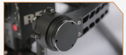
Precision High Power, High Torque Brushless Motors